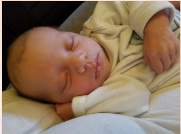
20 Days Old