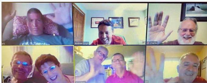
Zoom Fellowship & Prayer

Do NOT worry about anything , but in everything by PRAYER and SUPPLICATION with THANKSGIVING let your requests be made known to GOD. And the peace of God, which surpasses ALL understanding , WILL guard your hearts and your minds in Christ Jesus.