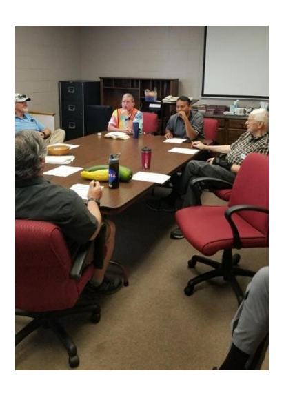
EUMC Memorial Garden

Methodist Men group met July 10, to plan and discuss things for the group in 2021. Our next meeting is Saturday, August 7th at 9:00 am, all men are welcome.