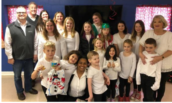
Christmas Caroling in the community and visit with church members Sunday, December 19<sup>th</sup>, Glory to God. Amen