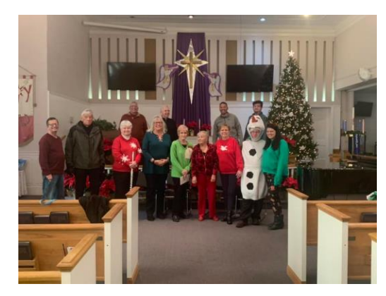
Sunday, December 26, 2021